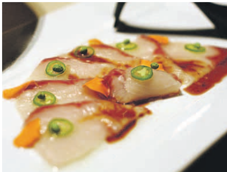
The yellowtail carpaccio is complemented by mellow but spicy kanzuri sauce