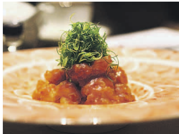
The spicy prawns with kanzuri are piquant, with lingering sweetness