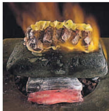
Megu's signature dish, Kagero steak

"We'd like to do the same here, of course," Yokoyama said, "but it's not easy with red tape. But we still in-